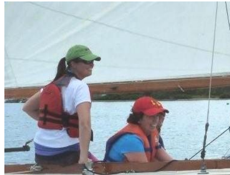
Sweet Summer Sailing